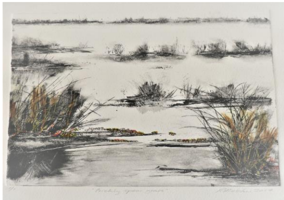
HOUSE Gallery March/April Exhibition